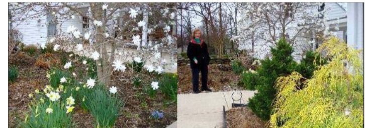
OLLIwood gardens, Mar 19

AS WE BEGIN THE SPRING 2008 TERM AT OLLI , the gardens at Tallwood delight our senses while anticipation of challenging courses satisfies our minds. Recently formed social groups invite us to greater fellowship. Let us recognize our red-dotted new members when we meet them in class and be sure to invite them to participate in our many OLLI extra-curricular activities, including a few exciting new groups--Singles, Walkers/Hikers, Gourmet Cooking, Happy Hour.