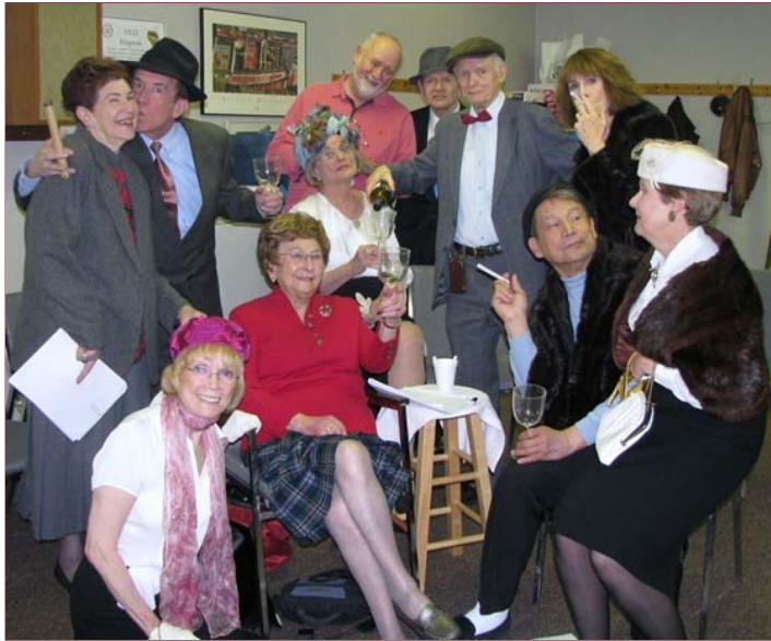
Cast photo by the writer.

THE OLLI PLAYERS' NEXT FILM , Sherlock Holmes and The Adventures of the Tolling Bell , was filmed at Channel 10 on Monday. It was done as an old-time radio show with homemade sound effects and keyboard. Once again The OLLI Players pulled the show together with only five days of rehearsal.