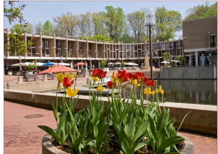
Lake Anne Plaza in Reston.