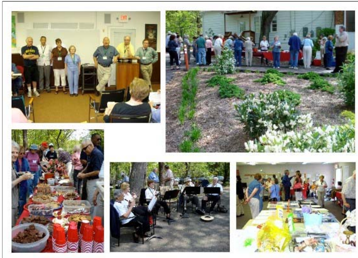
Board candidates answer questions at Annual Membership Meeting; members enjoy picnic goodies and music by the Recorder Ensemble; members look over silent auction items.