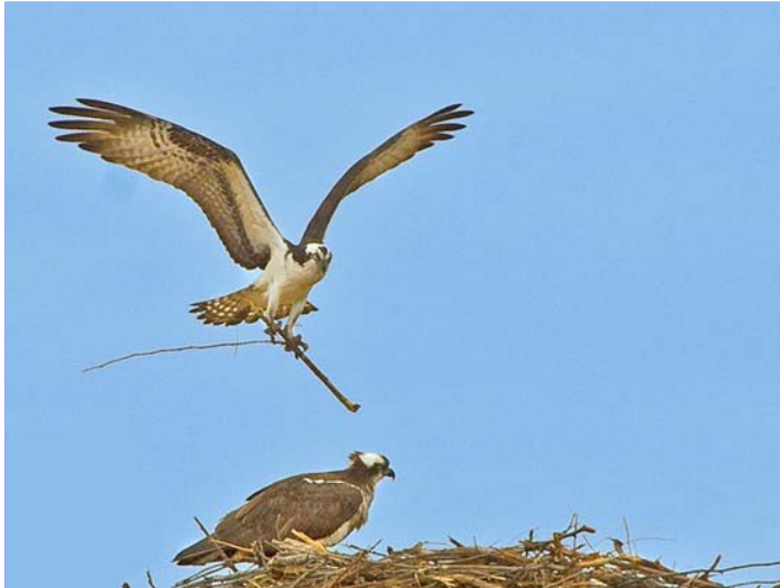
"Home Remodeling" (a pair of Ospreys working on their nest) by Steve Schanzer

DOWNLOAD AS WALLPAPER. In cooperation with the photographer, we are pleased to make this photo available for downloading and use as desktop wallpaper on standard monitors with a 4:3 width-to-height aspect ratio.