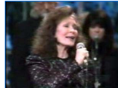
Loretta Lynn, "Don't Come Home a-Drinkin' with Lovin' on Your Mind" (listen and watch on YouTube )

Note: If there is sufficient interest, the Program Committee is considering a similar on-campus, non-fee class for women only that might feature such songs as--