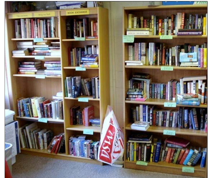
Overflowing bookcases, with books stacked in front of other books, preventing access to the shelved books (a "No, no!" to librarians).

Significant savings expected by eliminating coffee and cookies