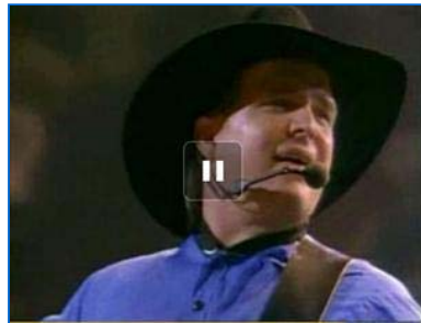
Garth Brooks, "Friends in Low Places" (listen and watch on Truveo.com )

This class will meet at an off-site location where lucky attendees will be served by attractive waitresses in revealing country attire. Attendees will listen to and discuss some of the greatest country songs -- "music that tells a story." Class fee: $55.00 (includes bottomless glasses of beer and unlimited chips and nuts). A sampling of currently planned discussion music follows.