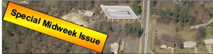
Banner image: artist's conception of new OLLI parking garage on pool parking lot.