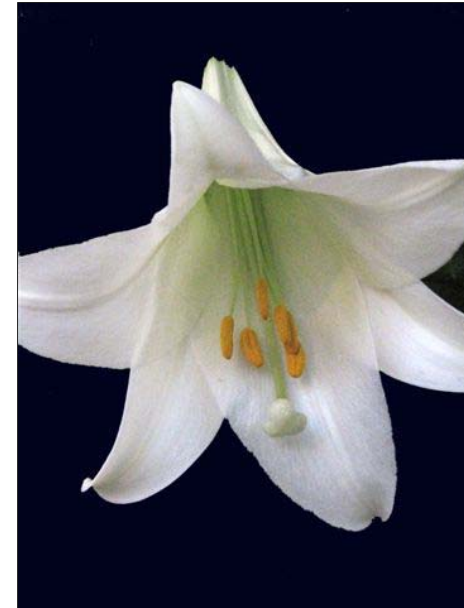
"Lily Blossom," by Rita Leake.

To view other photos by members of the Photography Club, please visit the Photography Club's Web site .