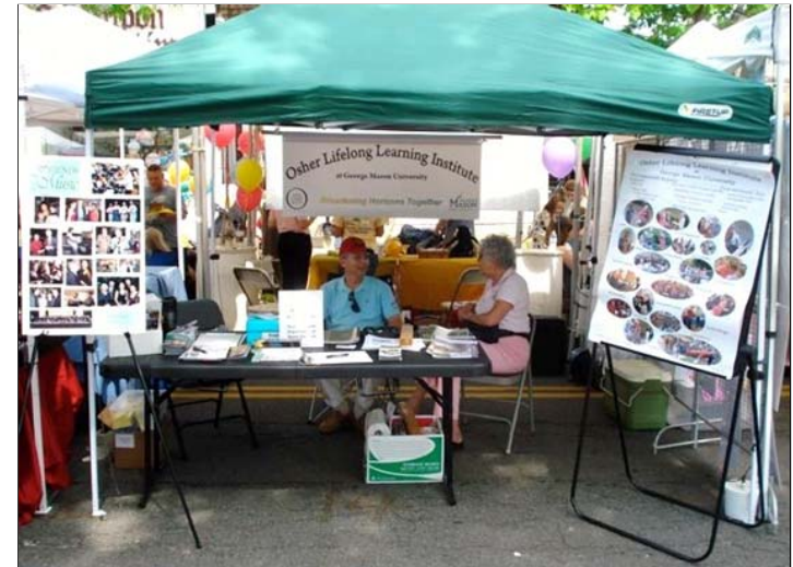
Combined OLLI and GMU Friends of the Center for the Arts and Friends of Music booth at Vienna festival.

T HE OLLI BOOTH AT THE VIENNA FESTIVAL last weekend, staffed 10:00 to 6:00 on Sun, May 24, and Mon, May 25, was a resounding success. Fifteen people signed up for more information and several more