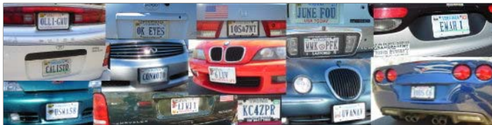
OLLI wants your license tag number!

If you change your email address, it is important that you notify OLLI or preferably, update your email address yourself through the Member Portal by clicking the Membership Tab, then clicking "Edit Personal Information." Please remember that to use the Member Portal you must first create a user account if you don't already have one. Instructions for doing this are on page 28 of your summer catalog and are also listed on the Member Portal when you click on "Get a User Account."