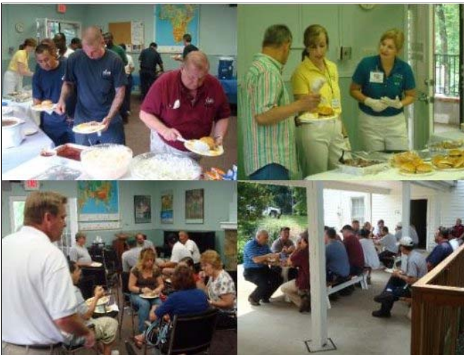
at the Appreciation Luncheon on Tuesday.