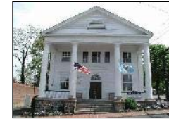
Old Town Hall, Fairfax City

I wanted to comment positively about the expanded "library" book shelves in the social room. I was able to find a book that I would like to try to read. I say 'try' because I am a slow reader and generally avoid the regular county library because I don't have enough time to get the book(s) read before they are due (even with renewals). So the informality of the OLLI library is great for me.