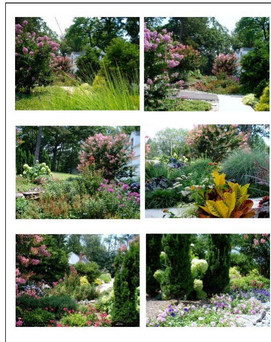
OLLIwood gardens in July 2008.