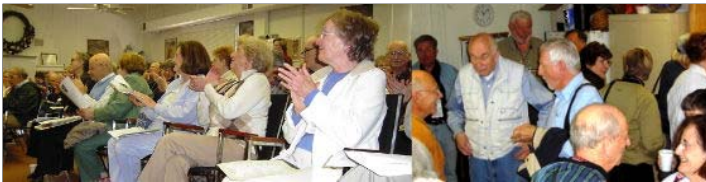
Typical OLLI scenes

T HE FIRST WEEK OF THE OLLI winter 2008 session at Tallwood and Lake