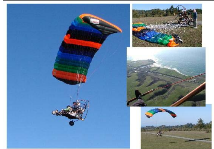
At left: underway; at right from top down: setting up, Monterey Bay, landing.

WHAT DO TWO SEPTUAGENARIAN BROTHERS DO when the older visits the younger in California? On my visit earlier this month, the younger took the older for a flight in his powered parachute.