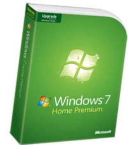
Windows 7 Home Premium One of many available versions