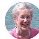
By Nancy Ragsdale, OLLI E-News staff writer

> Center for the Arts. Now is a good time to plan what you want to enjoy during the upcoming season. Beginning Sep 1, you can buy individual tickets for several upcoming performances of music, dance, and the theater or purchase a subscription for several performances in a particular genre, for example "All Music." Click on www.gmu.edu/cfa/calendar to see what's available and how to purchase tickets.