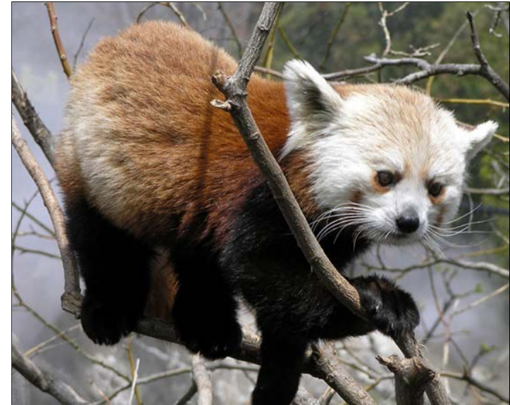
Photo of red panda taken by a club member

THE NEWLY ESTABLISHED OLLI PHOTOGRAPHY CLUB had an initial meeting at Tallwood last Friday with 16 people attending. The group laid out a general approach on how the club would function. Monthly club meetings will be at Tallwood on the last Friday of the month at 9:30 (thus, the next meetings will be on Sep 28, Oct 26, and Nov 30).