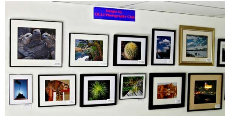
Some of photos on exhibit in annex.

See the work of the OLLI Photography Club