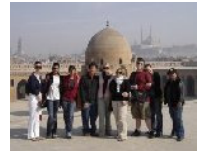
Last years group in Egypt