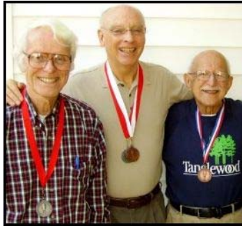
Three OLLI medalists from last year

OLLI members plan to participate -- starting this weekend