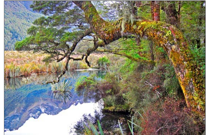
"A New Zealand Scene" by Andy Schoka

(The photo in its original size of 1024x683 pixels can be seen at this page )