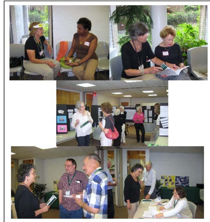
Scenes from the Reston Open House