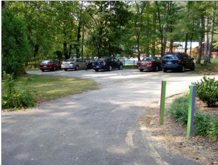
New parking area below the 'loop' at Tallwood.

I'm sure you'll agree with me that Mason treats us well and join with me in thanking them whenever possible.