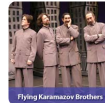
Flying Karamazov Brothers