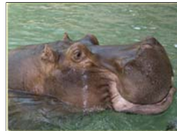
Happy the Hippo.