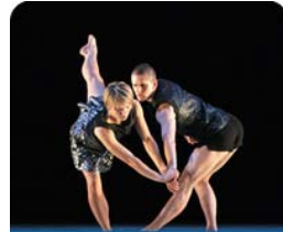
Richard Alston Dance Co.

Although they are not Russian—and not brothers—and cannot fly, this four-member comedy troupe of jugglers continues to entertain us with appearances from