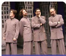
Flying Karamazov Brothers