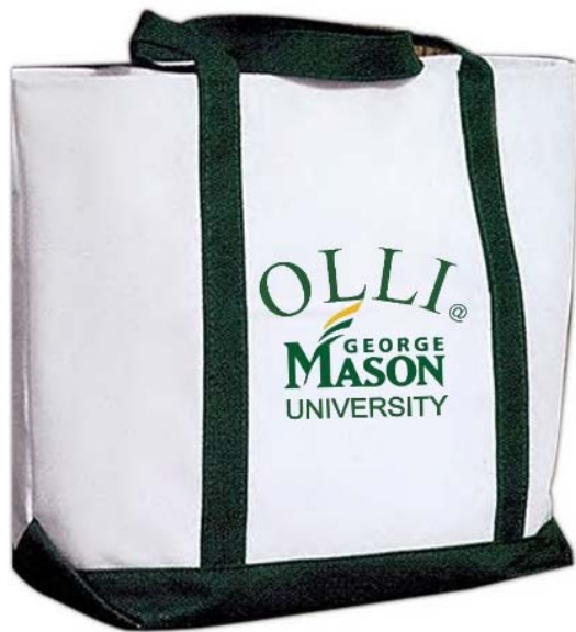
Canvas tote bag displaying the OLLI/Mason logo.

ORDER FORMS FOR OLLI SPIRITWEAR (new shirts, sweatshirts, tote bags and caps with the OLLI/Mason logo) are available in each classroom and can also be printed from this Web page (pdf) .