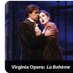
Virginia Opera: La Bohème