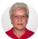
By Sharon Gilman, OLLI E-News Staff Writer

ON MON, OCT 13, FROM 1:00 TO 2:00 , sitting at a round table and swapping sandwiches, a group of about eight OLLI participants lunched together at the Lake Anne church. Each person brought a favorite sandwich and was prepared to give it away to someone else at the table. The group also had chips, pickles, dessert and beverages.