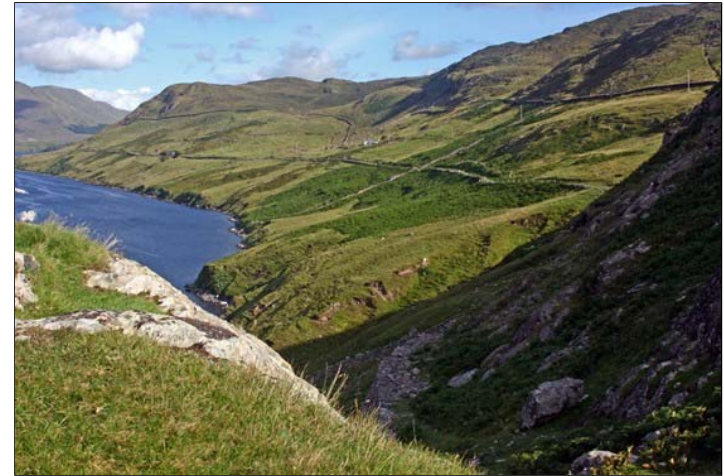
"Killarney Fjord" by Joan Axilbund

(The photo in its original size of 1024x683 pixels can be seen at this page )