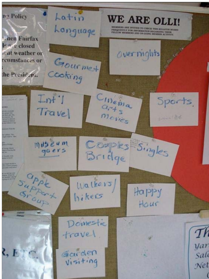
Bulletin board in social room annex; photo by Gordon Canyock

A reminder about how to indicate your interests