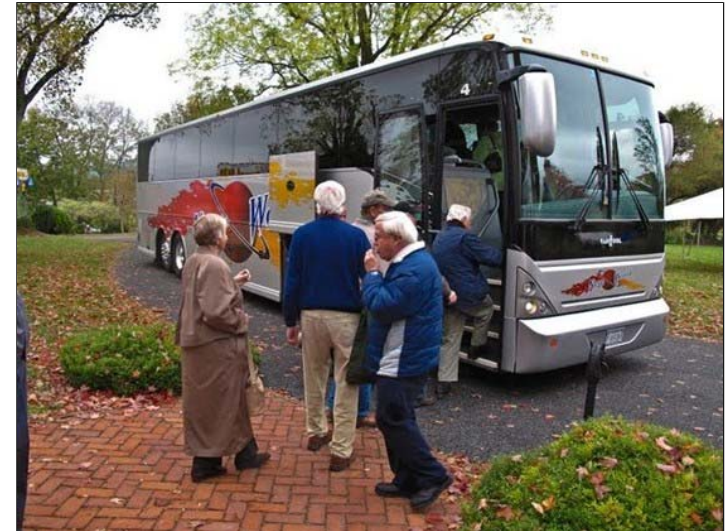
"On the way"

CAPPING A SERIES OF THREE CLASSES , more than 40 OLLI members and guests enjoyed a comfortable and first-ever bus trip from Reston to the lower Shenandoah Valley last Friday, October 16. On the way to the Valley, the group was provided with overviews of the Civil War during the critical year of 1864 and the significant Battle of Cedar Creek, which occurred 145 years ago just south of Middletown, Virginia.