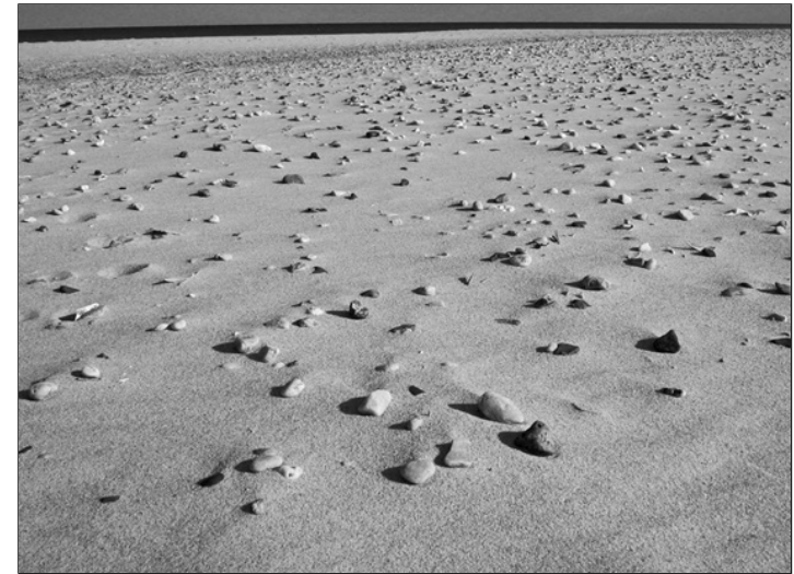
"Rockscape" by Don Allen.

To view the above photo in its original size and other sizes, see this Web page . To see other photos by members of the OLLI Photography Club, visit the club's Web site .