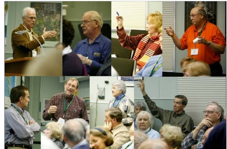
Scenes from last Friday's Town Hall Meeting